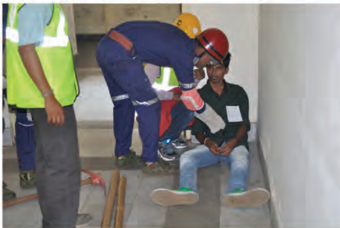
SDRF locates a victim and finds out his condition

Down Town hospital to observe emergency medical response in these hospitals.