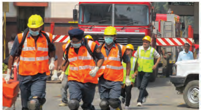
NDRF comes in to take command