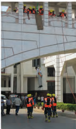
A victim being evacuated through rope rescue method