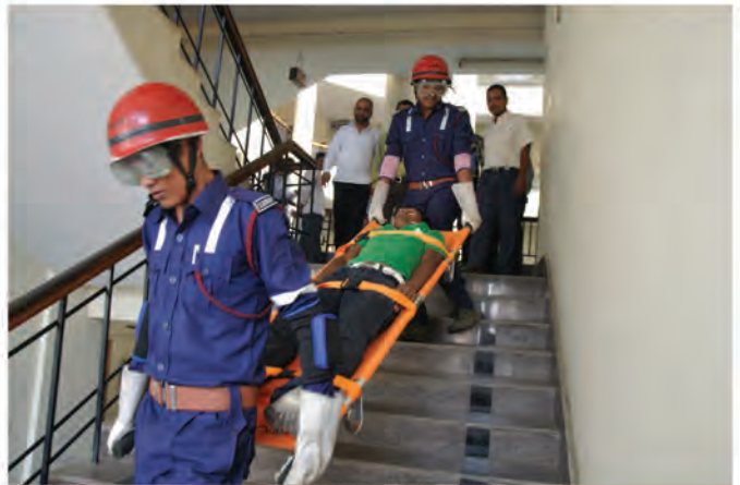
SDRF evacuating a victim out