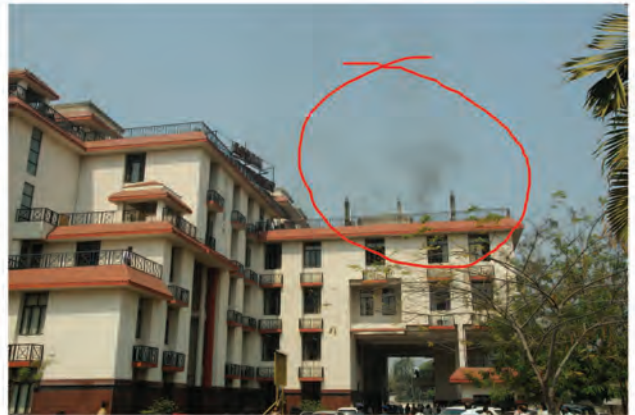
Smoke seen at Block A