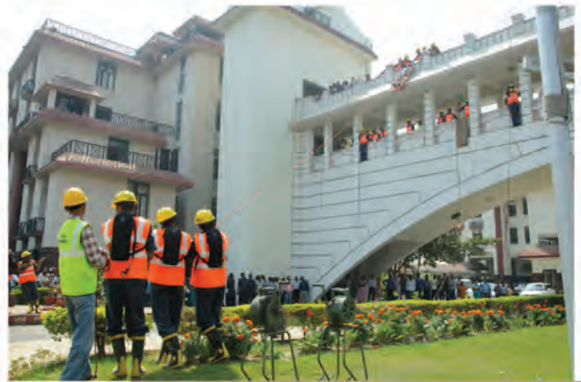
SDRF evacuating a victim out