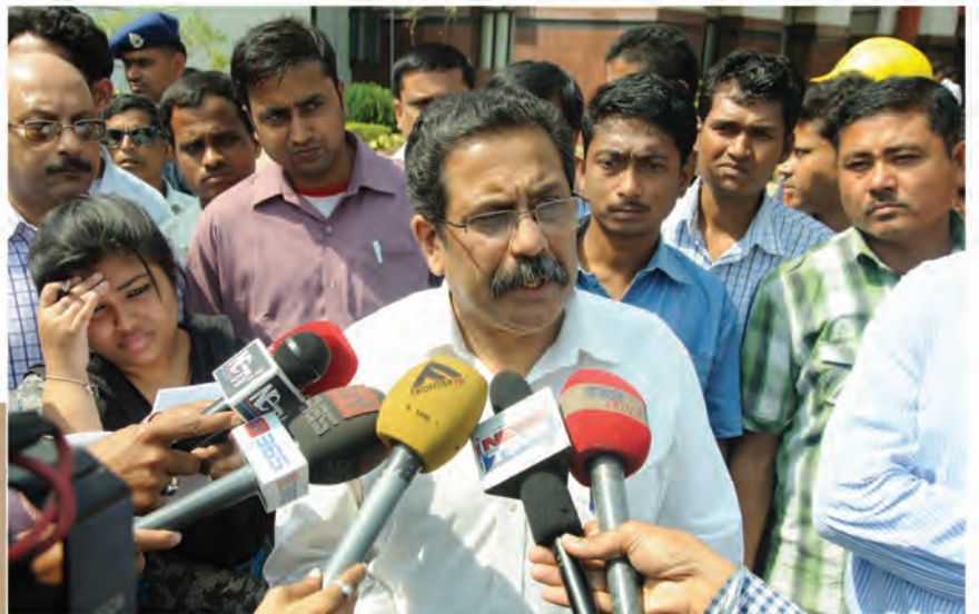
Commissioner & Secretary, SAD addressing the media