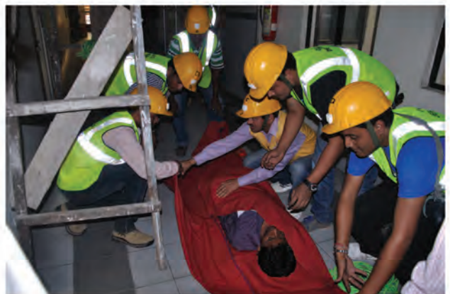
Civil Defence Volunteers with a victim