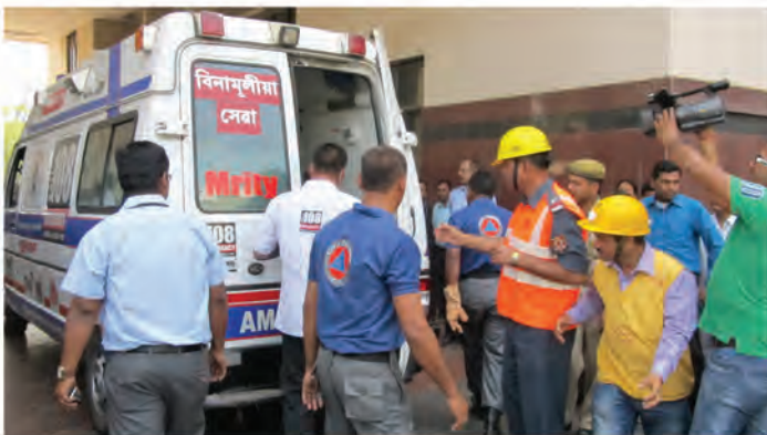
Victims being taken by the Ambulance