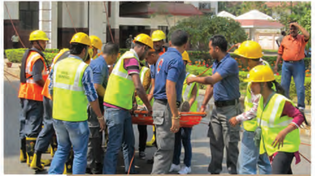
Civil Defence Volunteers taking a victim out