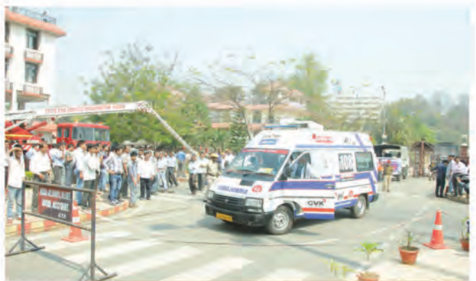
108 arrives at the scene