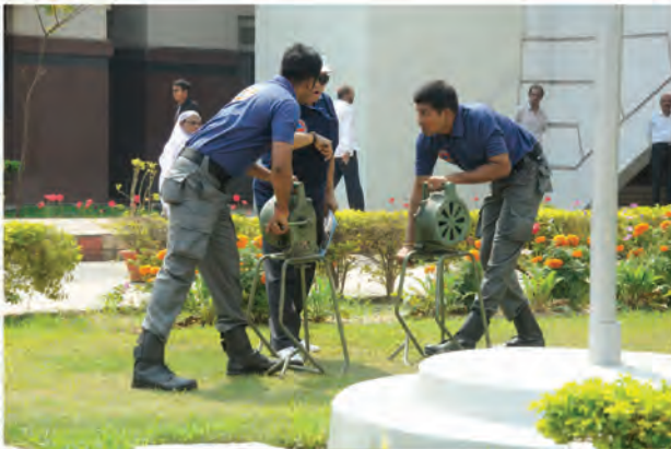
Siren being blown