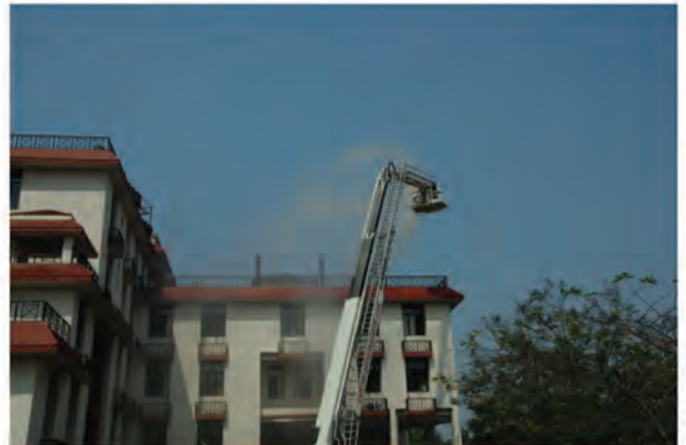
Fire fighting being demonstrated by the Fire Services

10 Mobile network were not operational for sometime creating problems in communication between Secretariat Security & 108.