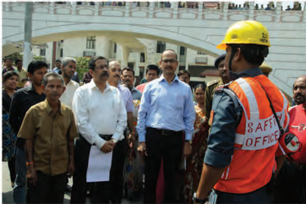
Safety Officer briefing the Commissioner & Secretary, SAD about the completion of the activity